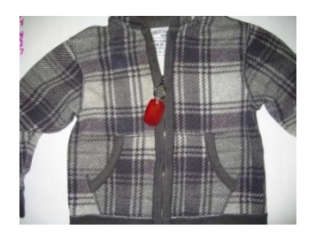
A zipper pull makes dressing easier for a child. You can buy zipper pulls or make one using a key chain as seen here.